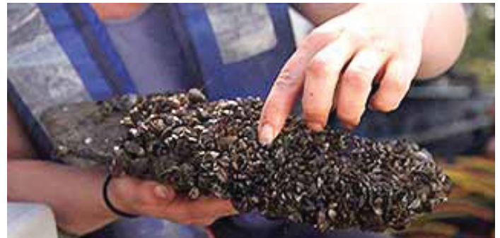
A scuba diver collects rocks from the river bottom. In the lab, zebra mussels are removed from the rocks, counted and their shells measured.

dissolved oxygen in the water, how acidic or basic it is (pH), how fast or slowly the current is, how much sunlight penetrates the water, how much suspended sediment the water contains, and its concentrations of nutrients (nitrogen and phosphorus). Three of these key factors are described below.