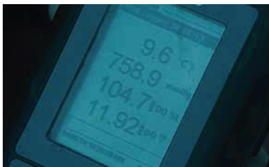
Researchers lower probes into the river that measure temperature, dissolved oxygen, pH and conductivity.

Abiotic (physical and chemical) factors affect the kinds and abundance of organisms that can inhabit a given ecosystem. Cary Institute scientists monitor a variety of abiotic factors, including the temperature of the water, the concentration of