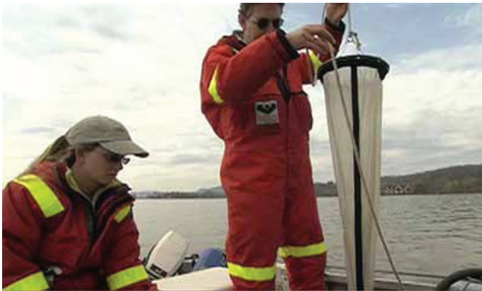
Small and large zooplankton are sampled by filtering river water through nets of different mesh sizes.

Sampling is expensive, and one challenge was deciding how many locations along the river would be sufficient. The Hudson River can be up to a mile wide and up to 90 feet deep, and its currents vary widely. Was the water homogeneously mixed, or were there significant differences between different depths and locations? How deep should they sample? Where the river is wide, would it be sufficient to sample a single point?