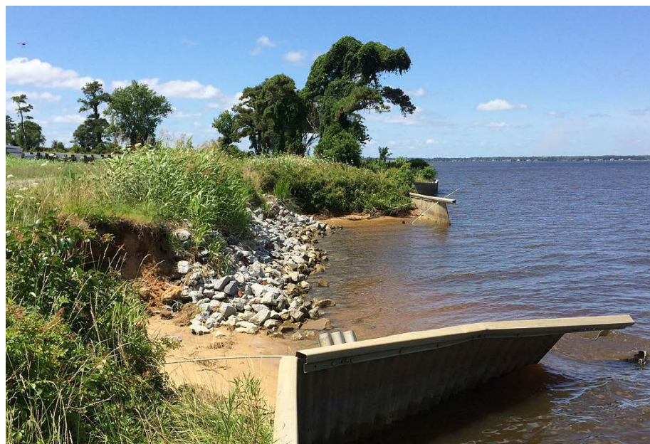
Storms can damage shore defenses, leading to erosion and even loss of the structure.

www.hrner.org/shorelinesforensicanalysis