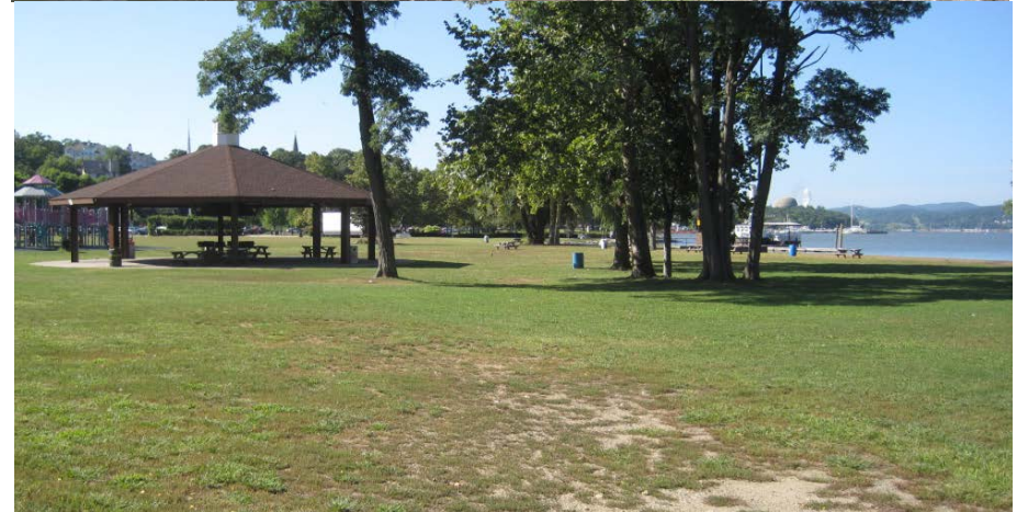
Steep sites with little room to maneuver and flat, open sites require very different treatment.