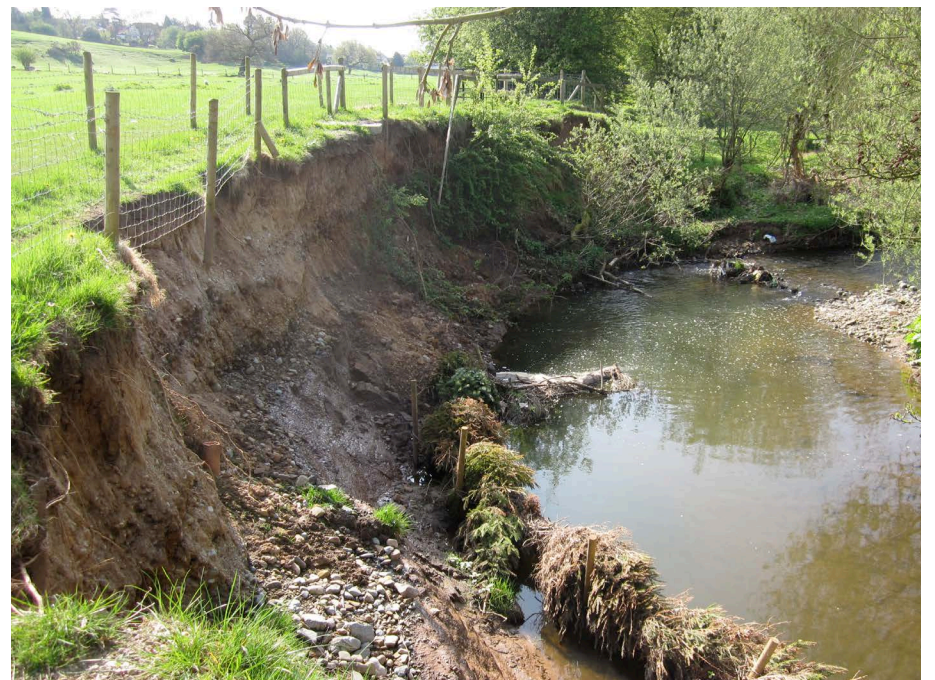
A shoreline that is eroding rapidly.

www.hrnerr.org/hudson-river-sustainable-shorelines/shorelines-engineering/shoreline-eroding