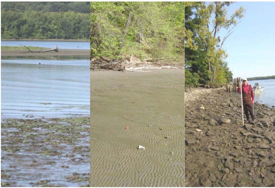
Muddy, sandy, and rocky soils have different abilities to support vegetation and infrastructure.