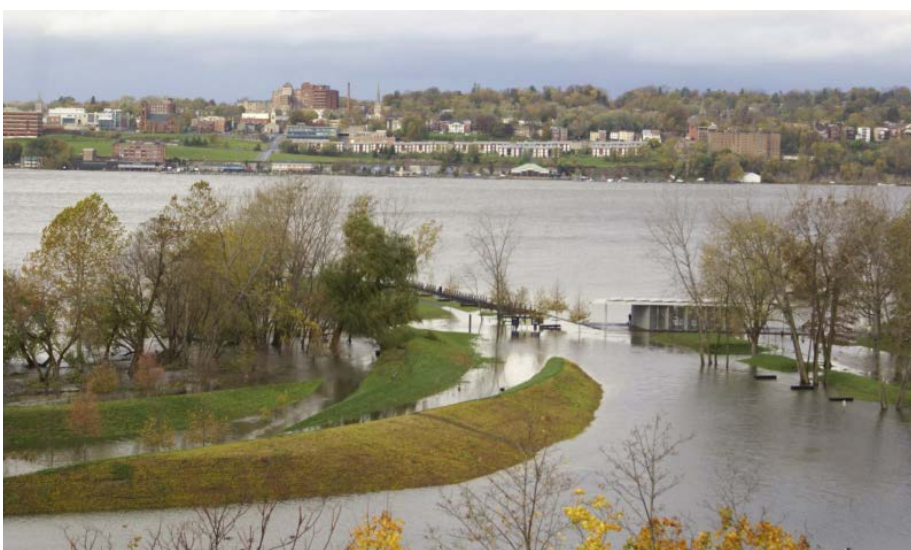
Rising water levels will flood many riverside properties, especially during storms.

Sea Level Rise Mapper scenichudson.org/slr/mapper