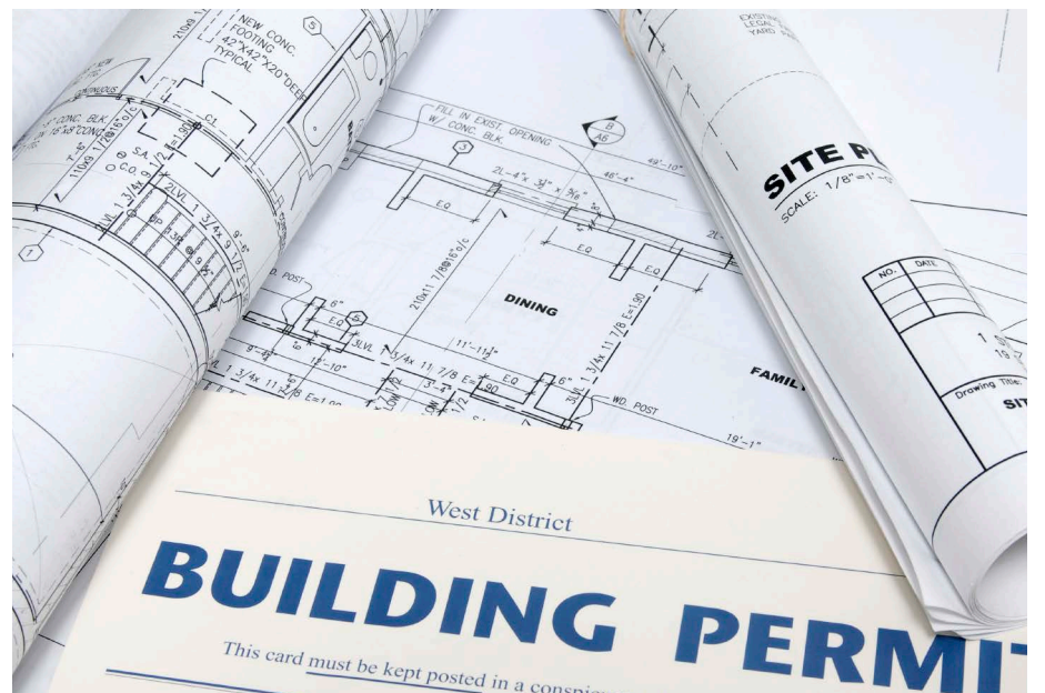
Understanding permit requirements early in the planning process can prevent later problems.

Many activities in the shore zone, including building new structures, require permits from federal, state, or local authorities. Be sure that the structure you have in mind is permissible (keeping in mind that structures that are legal elsewhere may not be permitted along the Hudson). You can save yourself a lot of trouble by getting in touch with your permitting agency early in the planning process.