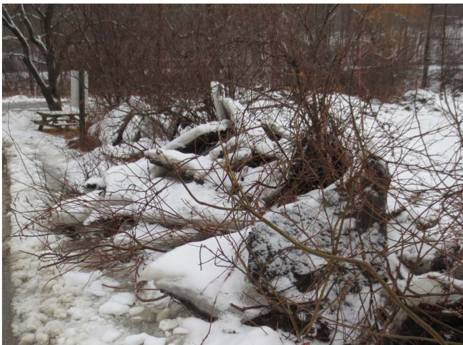
Ice is one of the physical forces that can damage Hudson River shorelines.

www.hrnerr.org/hudson-river-sustainable-shorelines/spatial-information-designing-shoreline