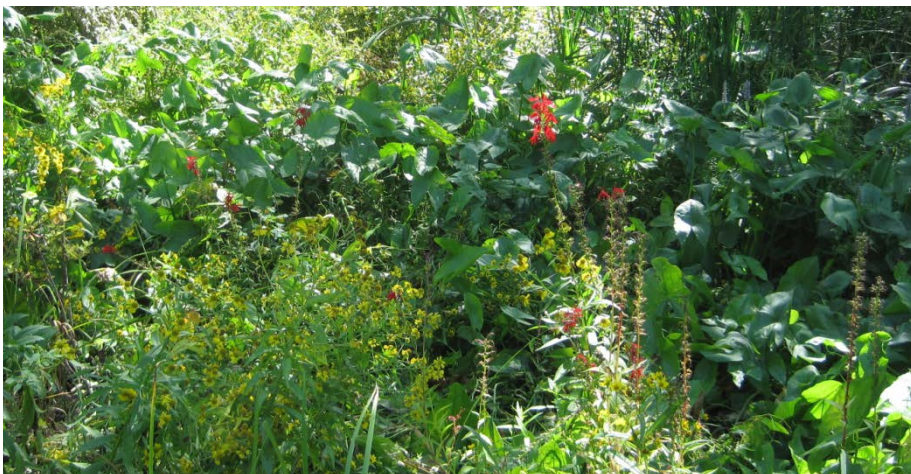
Well-managed shore zones provide valuable habitats for many plants and animals.

Natural Heritage Data (rare plants and animals) www.dec.ny.gov/animals/31181.html