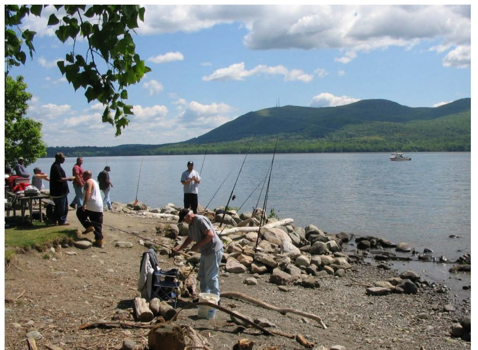
People use this site for fishing, so access to the water's edge is important, and occasional flooding probably is not.

Sites that can tolerate some erosion and flooding (e.g., a park) will benefit from different shoreline protection than sites with valuable and sensitive infrastructure (e.g., sewage treatment plant). Is there enough room to build anything that you'd like, or do current or planned uses in and around the site limit the size of possible designs? And because many kinds of shore defenses have visual and physical impacts (e.g., erosion) on nearby sites, it is important to consider current and future uses in the neighborhood as well. Be sure that your choice fits the planned uses of your site, and does not harm your neighbors.