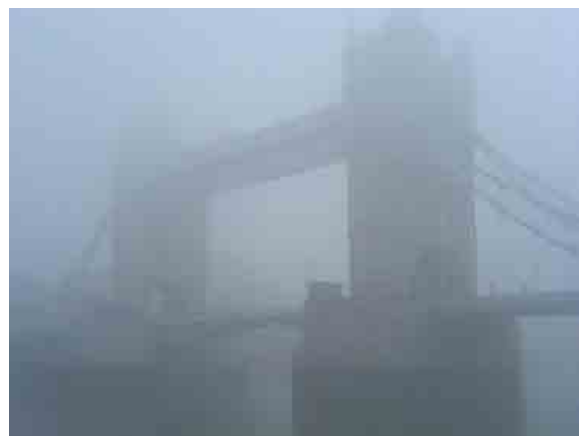
In foggy cities, such as London and Los Angeles, thousands of excess deaths have been attributed to the presence of acidic fog particles.

Fog is an integral part of some coastal regions and affects the lives and livelihoods of people living in these areas. The full range of ecosystem services and economic impacts of fog is still poorly understood. For this reason, socio-economic analysis of coastal fog systems is considered an immediate research priority.