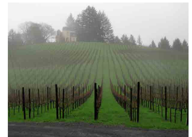
Changes in fog occurrence could impact the wine industry, which was valued at $13.4 billion in fog-affected Sonoma County, in 2012.