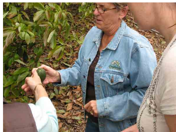
Winter fog days have decreased by 46% in the Central Valley of California since 1981, which is expected to have negative impacts on fruit and nut farming.