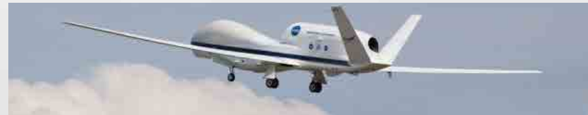
UAVs with basic sensors can be sent out into a fog event once it forms, increasing safety and reducing costs of fog data collection efforts.

Understanding how changes in climate affect fog frequency and distribution is an immediate research priority. This will require new tools for studying fog, including the use of paleoclimate proxies of fog presence, improved sensors and monitoring devices, improved satellite technology, and even drones, or UAVs, in addition to traditional aircraft.