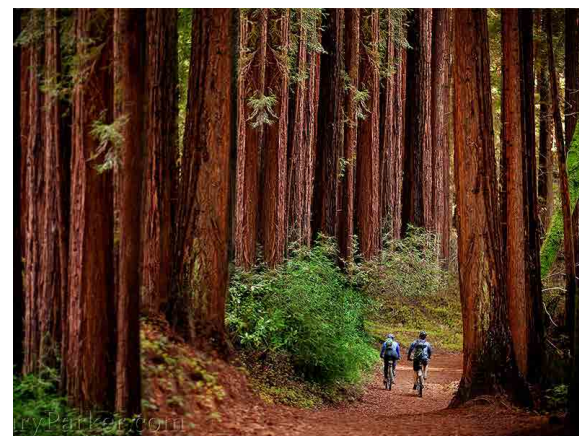
Redwood forests in California receive approximately 30-40% of their moisture from coastal fog.