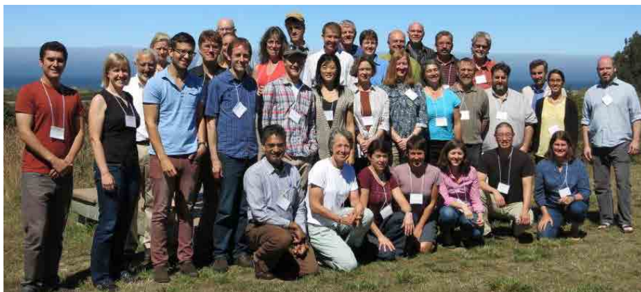
The fog research community came together to develop an interdisciplinary research agenda and is now poised to collaboratively implement that ambitious agenda.