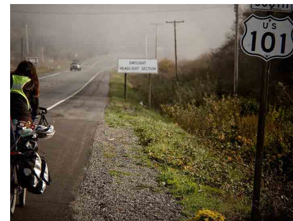
Fog disrupts transportation, creating hazardous conditions and costly traffic delays.